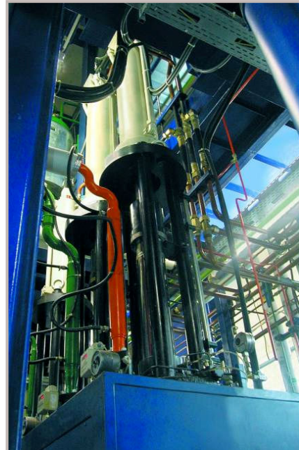
FiberFlex increases the economic efficiency of RRIM applications

Hennecke's FiberFlex is available as an optional subassembly. RIMDOMAT lines already in operation can hence be retrofitted.