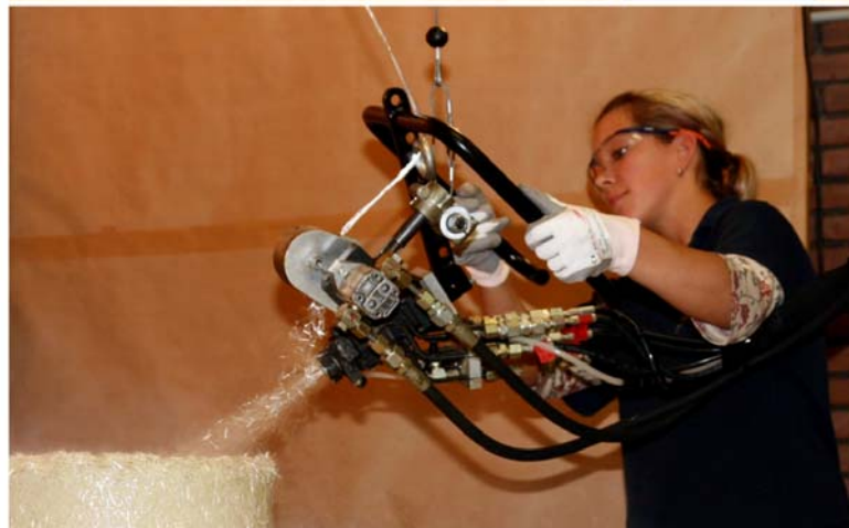
Hand-operated spraying process. Photo above: without glass fibre metering, below: with glass fibre metering.