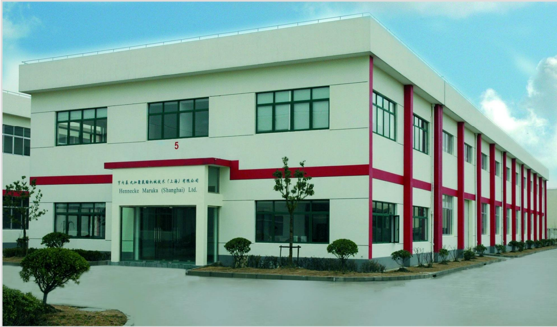
The new facilities of Hennecke-Maruka Shanghai