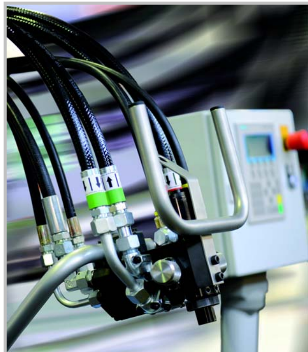
MXL mixhead with air cleaning

This combination offers PU processors precise component metering and excellent mixing quality for many applications in all kinds of areas. The output can range from 100 – 1,500 g/sec depending on the size of the machine. The hand-operated mixhead is used for cold-curing flexible foam, compact systems, filling foam, integral skin foam, energy-absorbing foam and